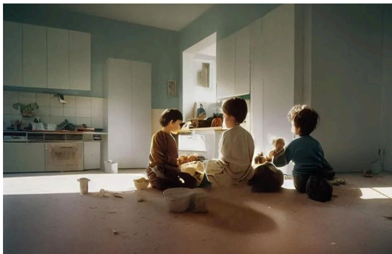
An AI-generated image by Canadian charity Furniture Bank. The charity argues this has solved one of the ethical dilemmas posed by using real beneficiaries in fundraising communications.

principles such as transparency, accountability, and respect for donor privacy. It should also ensure that AI is used in a way that is consistent with the values of the fundraising organisation. By adopting an ethical AI framework, fundraising organisations can help to ensure that AI is used in a way that is beneficial to both donors and the organisations themselves, and ultimately the beneficiaries those organisations help.