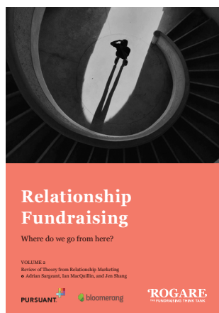
Volume 2 Review of theory from social psychology