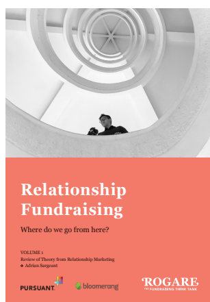
Volume 1 Review of theory from relationship marketing