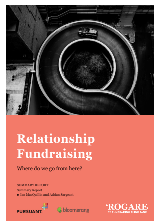
Volume 4 Summary report